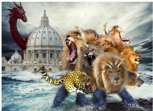
FIRST BEAST: Vatican/Papal Rome

which are four, are four kings which arise out of the earth. (23) Thus he said: The fourth beast shall be a fourth kingdom on earth, which shall be different from all other kingdoms, and shall devour the whole earth, trample it and break it in pieces.