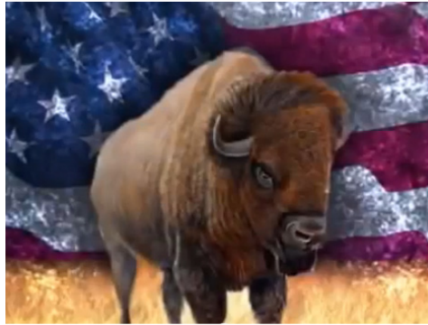
SECOND BEAST: United States

to the image of the beast, that the image of the beast should both speak and cause as many as would not worship the image of the beast to be killed.